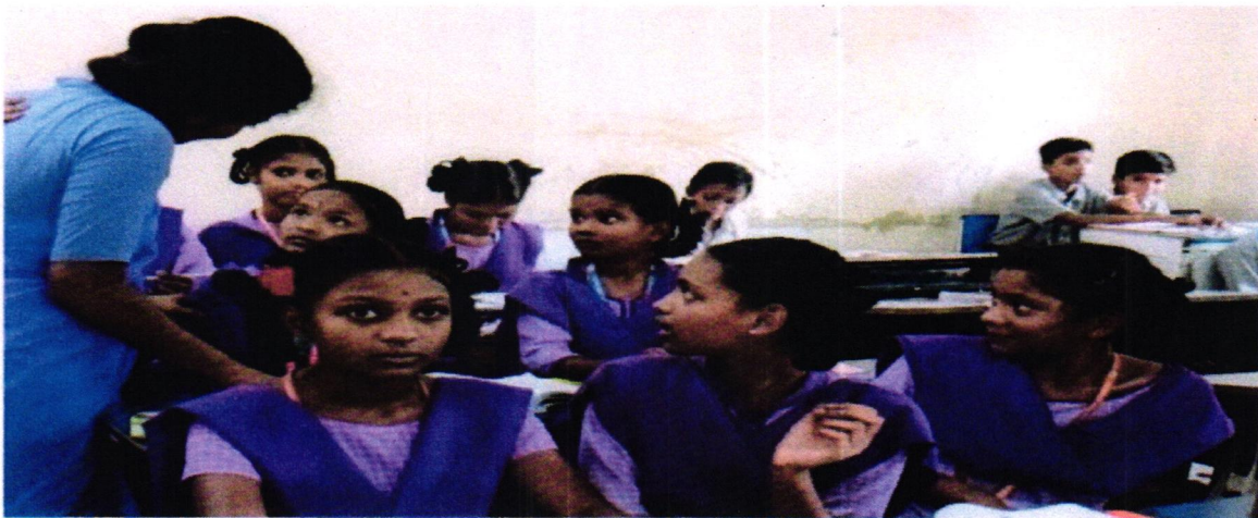
Awareness on Road Safety and School children, Dakkilivari Palem on 28 Dec 2023

On December 28, 2023, the NSS Unit of Narayana College of Nursing will organize a program focused on Road Safety for school children at Dakkilivari Palem. The initiative aims to educate participants about various types of traffic and raise awareness of potential dangers associated with road use. All faculty members and IV-year nursing students are encouraged to actively participate in this important program. The event will feature informative sessions on traffic rules, safe crossing practices, and the importance of pedestrian safety. Interactive activities will engage children and reinforce key safety messages. By fostering awareness and understanding of road safety, the program seeks to empower children to navigate traffic safely and responsibly. Overall, this initiative highlights the critical importance of road safety in protecting young lives. 99 participants and 45 village peoples are benefited through this program