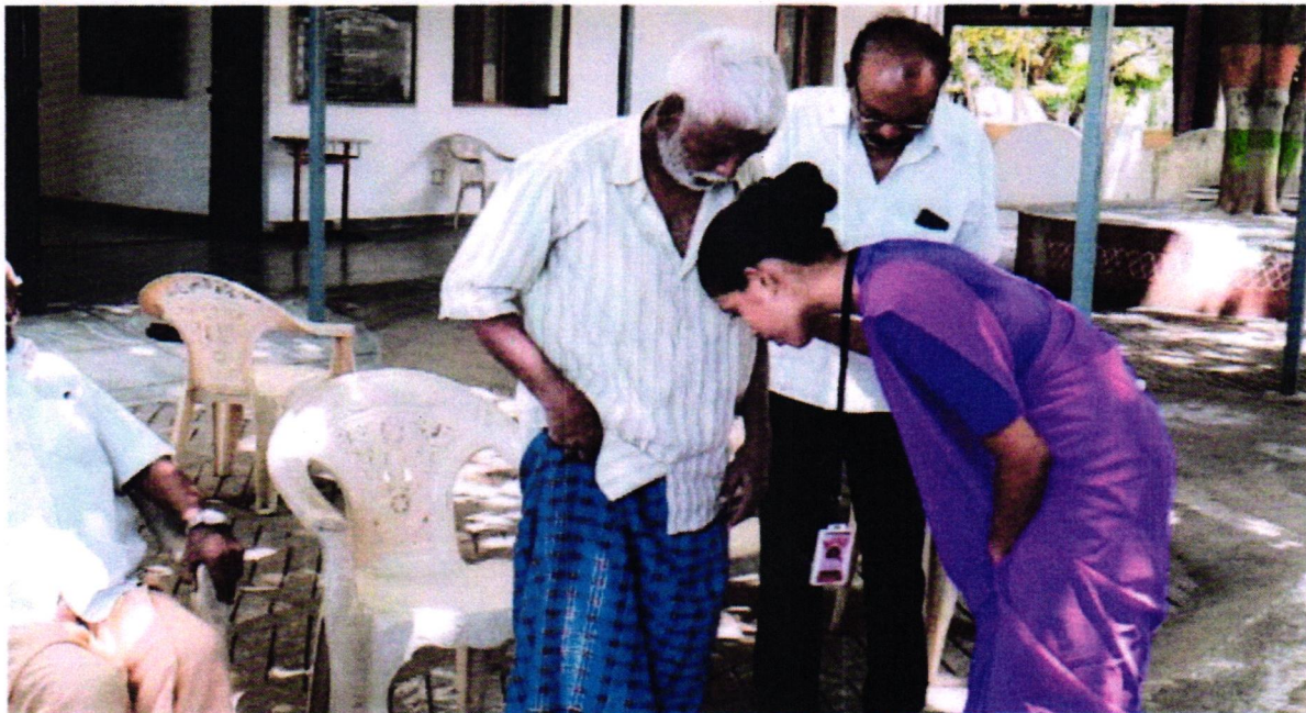
Awareness on Elder Protection Awareness Campaign, Venkatachalam on 15 June 2023

The NSS Unit of Narayana College of Nursing organized an "Elder Protection Awareness Campaign" on June 15, 2023, at Venkatachalam. This initiative aimed to implement comprehensive strategies to build community awareness and foster a culture of vigilance and support for the elderly. Faculty members and fourth-year students actively participated, engaging the community through informative sessions, discussions, and resource distribution focused on the rights and protection of older adults. The program highlighted the importance of recognizing signs of abuse and neglect, encouraging community members to advocate for the safety and well-being of seniors. By promoting awareness and encouraging proactive support, the event aimed to create a more compassionate and protective environment for the elderly. 45 participants and 32 village peoples are benefited through this program.