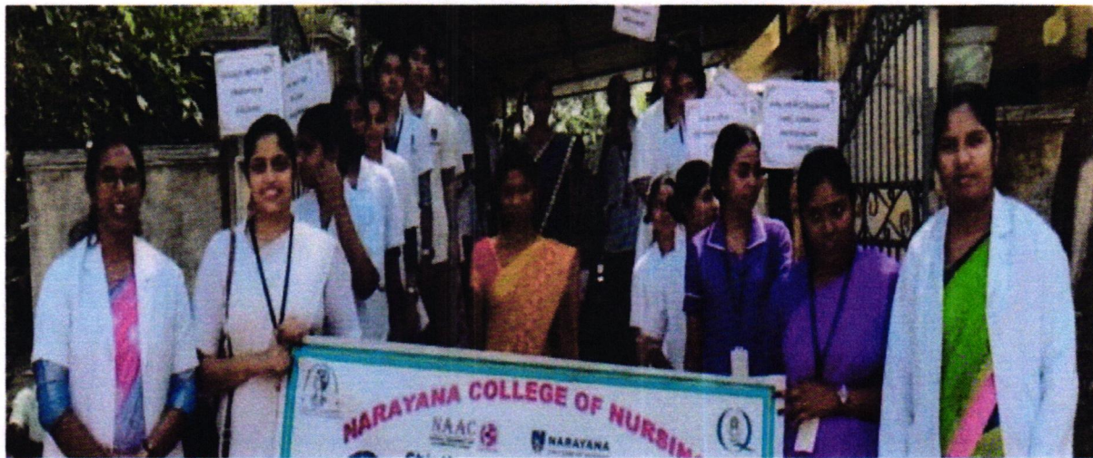
Awareness on Substance abuse prevention, Venkatachalam on 26 June 2023

The NSS Unit of Narayana College of Nursing organized a "Substance Abuse Prevention" event on June 26, 2023, at Venkatachalam. This initiative aimed to increase awareness among students about the dangers and consequences of drug abuse. Faculty members and fourth-year students actively participated, engaging the community through informative sessions, discussions, and interactive activities that highlighted the health, social, and legal repercussions of substance use. The program emphasized the importance of making informed choices and provided resources for support and prevention. By fostering open dialogue and encouraging healthy lifestyle choices, the event aimed to empower students to resist substance abuse and promote a healthier community. 50 participants and 31 village peoples are benefited through this program.