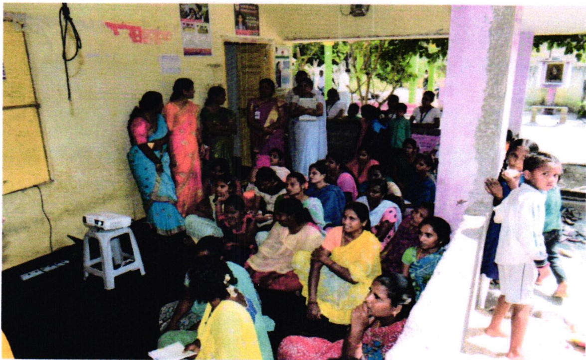
Awareness on Oral Health and Wellness Outreach, Venkatachalam on 20 Mar 2024

On March 20, 2024, the NSS Unit of Narayana College of Nursing will organize an Oral Health and Wellness Outreach program at Venkatachalam. This initiative aims to improve the determinants of oral health, such as promoting a healthy diet and enhancing oral hygiene practices, while also addressing disparities in oral health accessibility between rural and urban populations. All faculty members and first-semester students are encouraged to actively participate in this important program. The event will feature educational sessions on proper oral care, the significance of nutrition for oral health, and strategies to reduce common dental issues. Interactive activities will engage the community, fostering awareness and encouraging better oral health practices. Overall, the program seeks to empower individuals with knowledge and resources to improve their oral health and well-being. 40 participants and 30 village peoples are benefited through this program