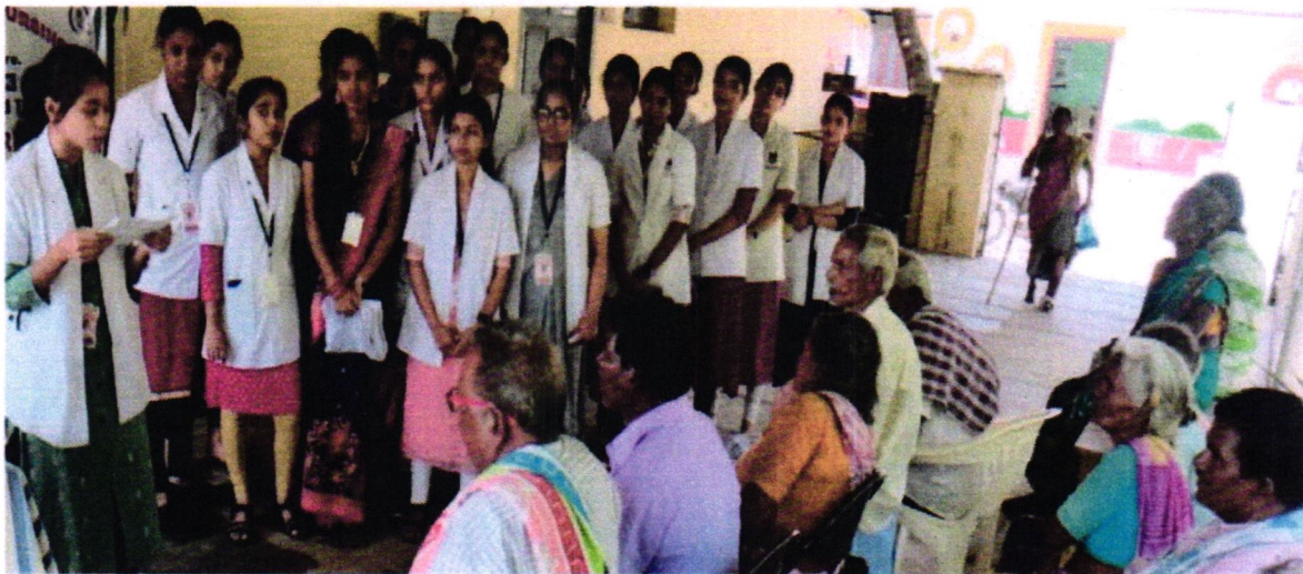
Plastic Reduction Awareness Campaign, Kamakshi Nagar on 2 July 2023

The NSS Unit of Narayana College of Nursing organized a "Plastic Reduction Awareness Campaign" on July 2, 2023, at Kamakshi Nagar. This initiative aimed to introduce and encourage the adoption of sustainable alternatives to single-use plastics. Faculty members and first- and second-year MSc students actively participated, engaging the community through informative sessions, discussions, and demonstrations of eco-friendly products. The program highlighted the environmental impact of plastic waste and provided practical tips for reducing plastic consumption in daily life. By promoting awareness and encouraging sustainable practices, the event aimed to inspire individuals to take action for a healthier planet and foster a culture of environmental responsibility. 14 participants and 19 village peoples are benefited through this program