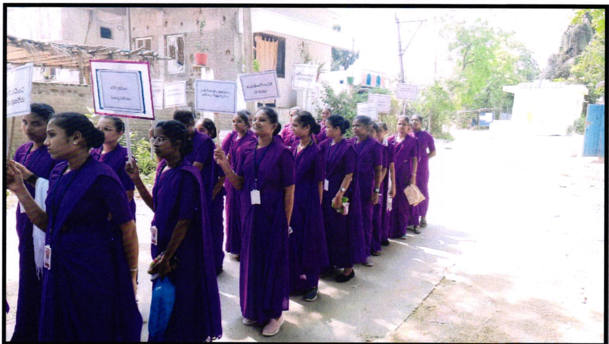
Fig: 1 Rally on Educating Hazards of Mosquito Breeding

An extension activity on the Filaria Control Program was organized by Narayana College of Nursing in the community of Saraswathi Nagar on 11/11/2023 with the aim of promoting awareness on the prevention and control of lymphatic filariasis. The event included a health awareness rally conducted by 55 nursing students and guided by 4 faculty members from the Department of Community Health Nursing. The rally featured slogans, placards, and community interaction to educate the public on the importance of mosquito control, personal protection, and health education sessions and distribution of IEC (Information, Education, and Communication) materials were also conducted during the program. A total of 48 local residents directly benefited from the activity through increased awareness and motivation to participate in preventive health practices. The program not only strengthened community engagement in public health initiatives but also provided students with meaningful experiential learning in field-based health promotion.