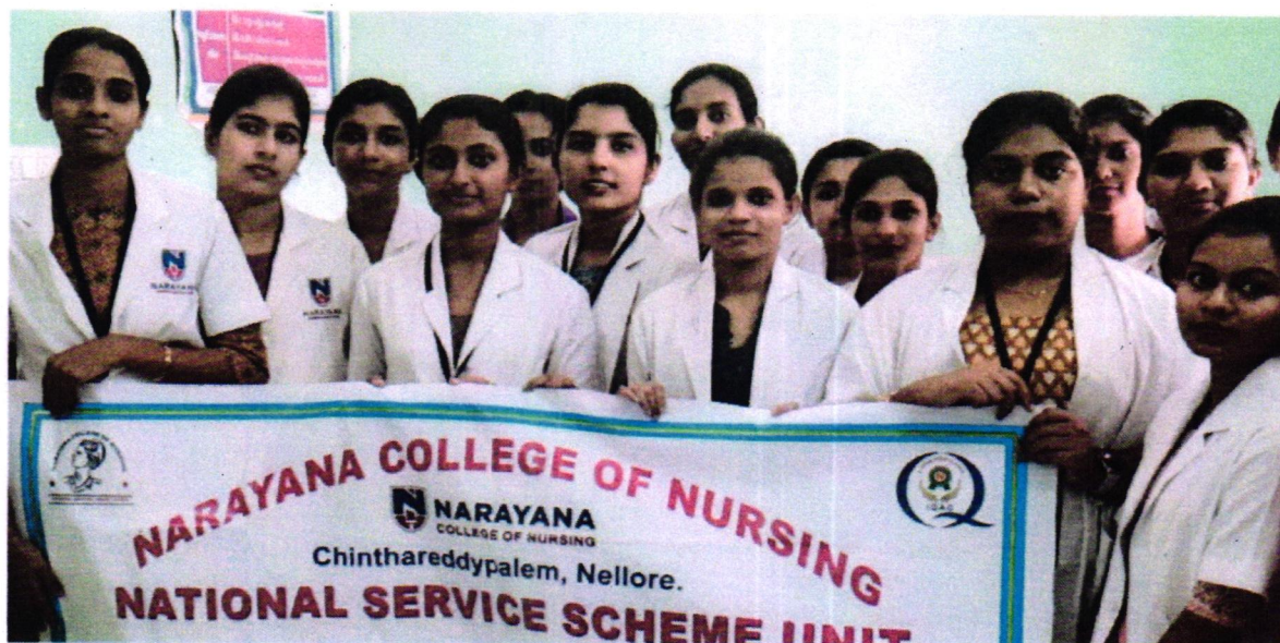
Public Information Campaign on Suicide Prevention, Kakatur on 9 Sep 2023

The NSS Unit of Narayana College of Nursing, in collaboration with the Mental Health Nursing department, organized a "Public Information Campaign on Suicide Prevention" on September 9, 2023, at Kakatur. The initiative aimed to raise awareness about reducing stigma and encouraging open conversations about mental health to prevent suicides. Faculty members and third-year students actively engaged with the community through informative sessions and discussions. Educational materials were distributed to help individuals recognize warning signs and offer support. The program emphasized the importance of mental health awareness and creating a safe environment for seeking help. By fostering dialogue and understanding, the campaign aimed to empower individuals to take proactive steps in suicide prevention. 60 participants and 32 village peoples are benefited through this program