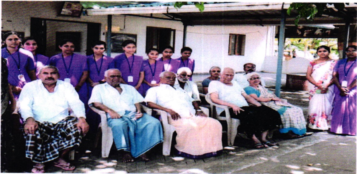
Awareness on Support for Viral Hepatitis Awareness, Kakatur on 28 July 2023

The NSS Unit of Narayana College of Nursing organized a "Support for Viral Hepatitis Awareness" event on July 28, 2023, at Kakatur. This initiative aimed to raise awareness about viral hepatitis, enhance understanding of its impact, and promote actions for prevention, diagnosis, and treatment. Faculty members and second-year Post Basic BSc Nursing students actively participated, engaging the community through informative sessions, discussions, and distribution of educational materials. The program emphasized the importance of vaccination, safe practices, and regular health check-ups. By fostering awareness and encouraging proactive health measures, the event aimed to empower individuals to protect themselves and their communities from the risks associated with viral hepatitis. 26 participants and 20 village peoples are benefited through this program