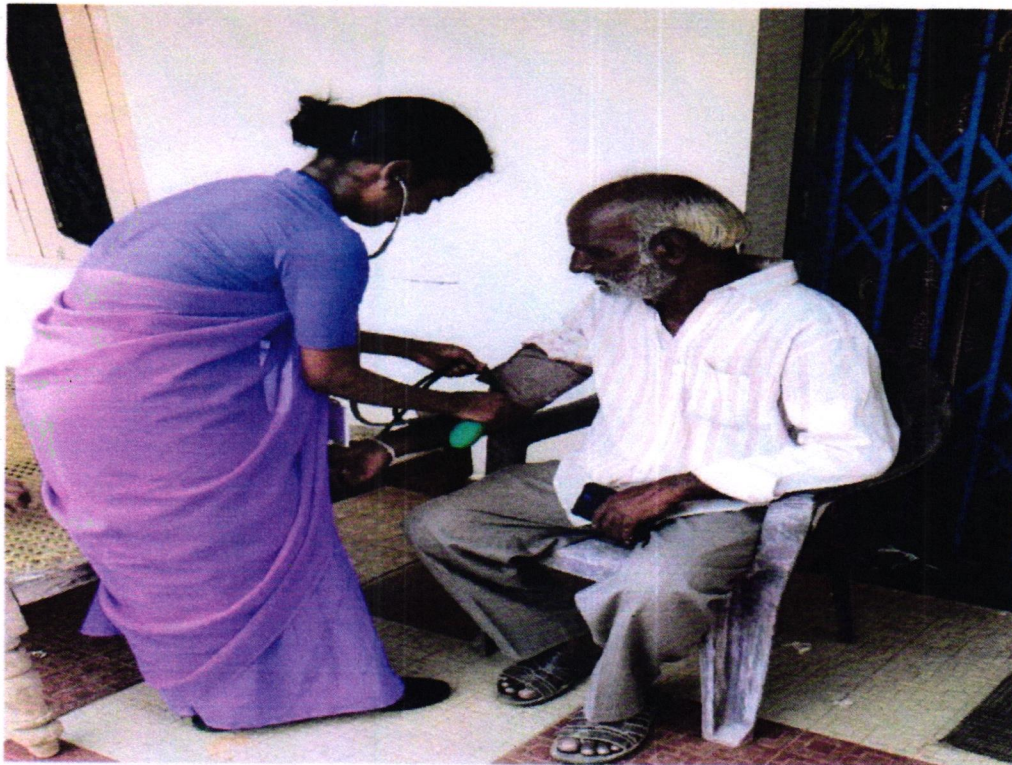
Awareness on High Blood Pressure Outreach Activity, Venkatachalam on 14 Aug 2023

The NSS Unit of Narayana College of Nursing, in collaboration with the Medical & Surgical Nursing department, organized a "High Blood Pressure Outreach Activity" on August 14, 2023, at Venkatachalam. This initiative aimed to raise awareness about hypertension, promote regular blood pressure monitoring, and provide educational resources for managing and preventing high blood pressure. Faculty members and first- and second-year Post Basic BSc Nursing students actively participated, engaging the local community through informational sessions, health screenings, and discussions on lifestyle changes and dietary recommendations. The program emphasized the importance of awareness and proactive health management, empowering individuals to take charge of their cardiovascular health for better overall well-being. 47 participants and 30 village peoples are benefited through this program