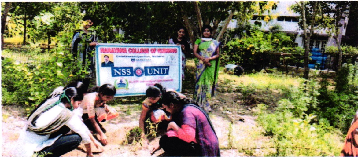
Environmental Awareness, Saraswathi Nagar on 5 Dec 2023

On December 5, 2023, the NSS Unit of Narayana College of Nursing organized an Environmental Awareness Program at Saraswathi Nagar. The event aimed to demonstrate ways to protect and preserve natural resources. Faculty members and III Semester students actively participated, engaging in informative sessions and discussions. Participants learned about environmental issues, conservation techniques, and sustainable practices. The program included interactive activities that encouraged community involvement. Feedback indicated a heightened awareness and commitment to environmental stewardship among attendees. Overall, the event successfully fostered a sense of responsibility toward preserving our planet for future generations. 65 participants and 24 village peoples are benefited through this program