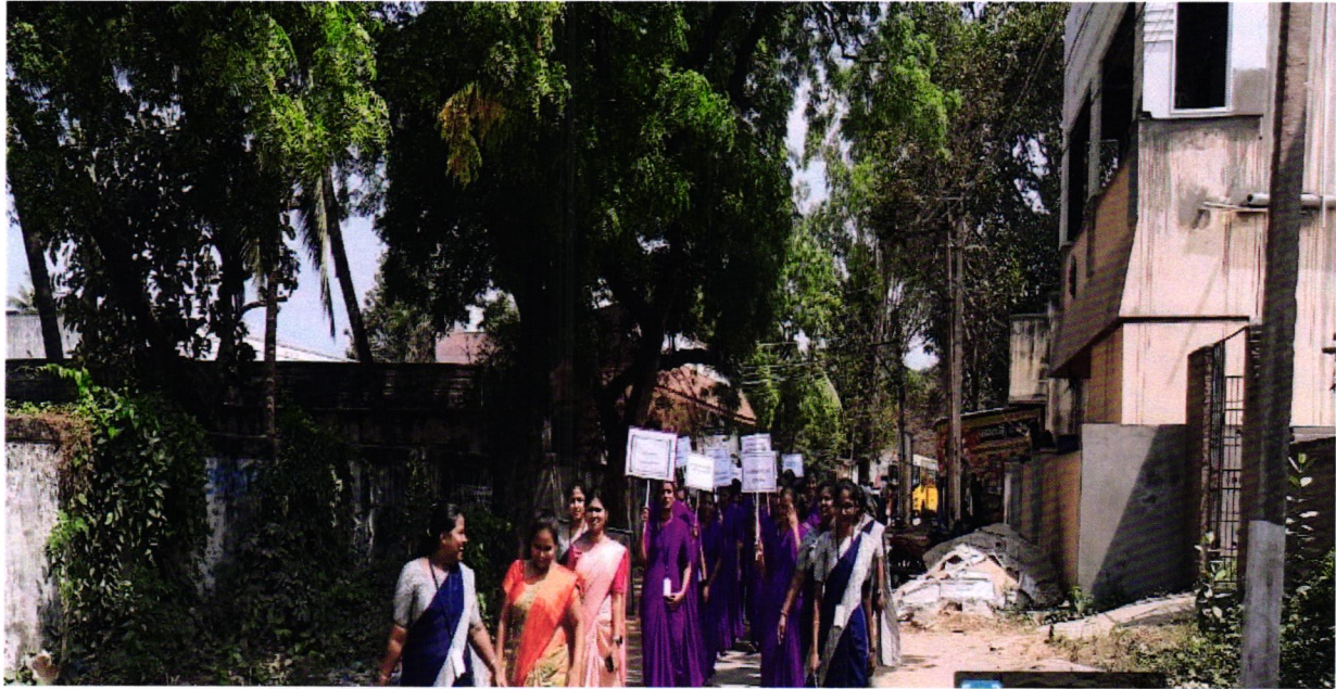
Fig: 2 Faculty directing during the activity