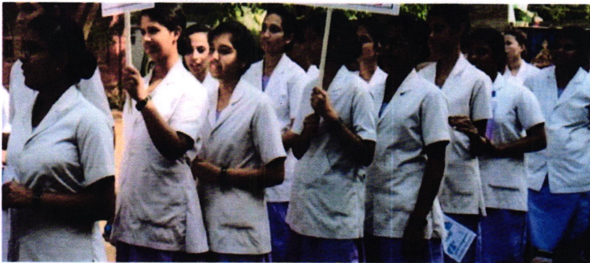
Deaf Awareness Initiative, Venkatachalam on 23 Sep 2023

The NSS Unit of Narayana College of Nursing organized a "Deaf Awareness Initiative" on September 23, 2023, at Venkatachalam. This event aimed to promote knowledge and understanding about the Deaf community while breaking down barriers between Deaf and hearing individuals. Faculty members and first- and second-year Post Basic BSc students actively participated, engaging the community through informative sessions, discussions, and demonstrations of basic sign language. The program emphasized the importance of inclusivity and effective communication, fostering empathy and respect for the Deaf community. By raising awareness and encouraging dialogue, the initiative sought to create a more inclusive environment for everyone. 33 participants and 20 village peoples are benefited through this program